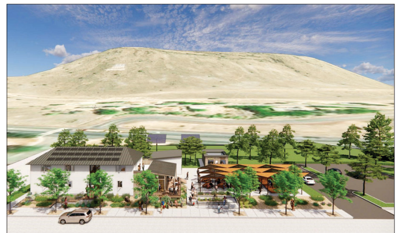
Architects' drawing of the future business development site.

Recently, the Visit Bend Sustainability fund awarded