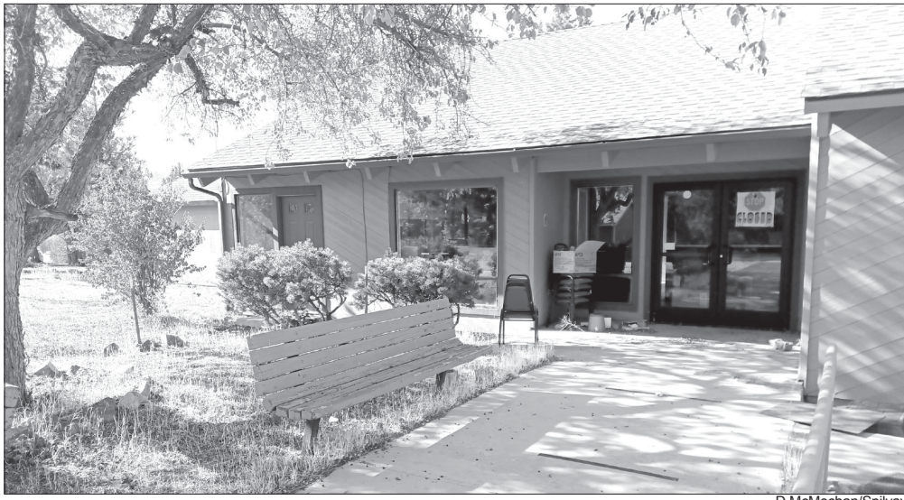
The Senior Wellness Center should be opening soon. An open house day will be announced when the date is certain.

center has been delayed due to working through the insurance process; and also by the covid pandemic.