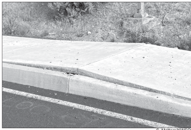
Sidewalk in Warm Springs pushed up by the heat.