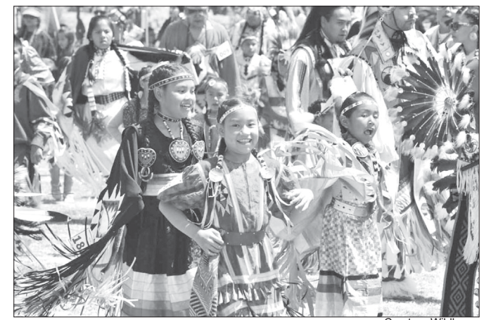
Scene from the 2022 Wildhorse Powwow.

The intensity and stamina of the dancers was enough to amaze. But add to the mix temperatures in the 90s and dancing in a buckskin dress or at the pace of a mating