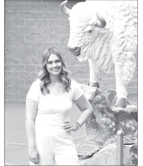
graduates, both from Warm Springs, just fulfilled the OHSU Tribal Health Scholars Program.