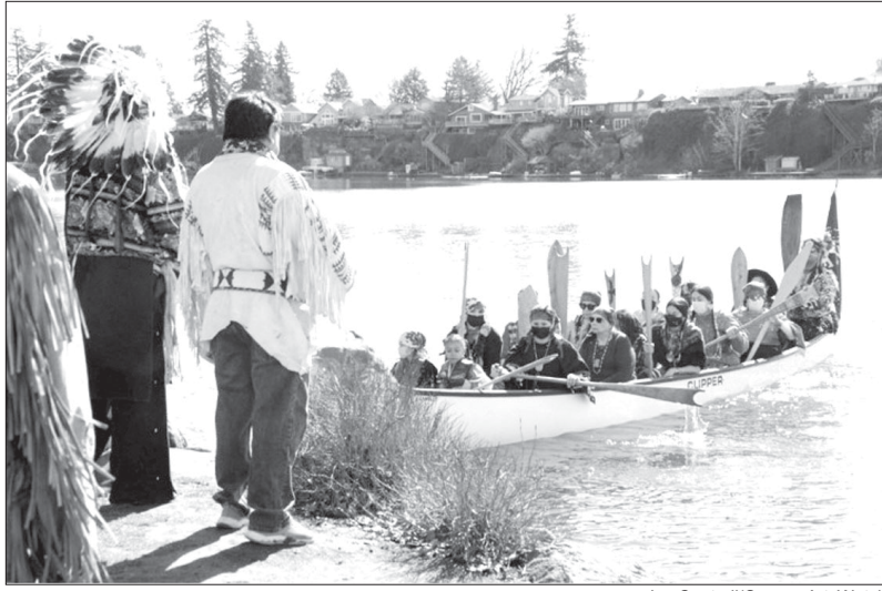
Canoeists welcomed the ceremonies and the day at Fairview’s Blue Lake Regional Park.

The river flattened, the waters opened for barges and closed for salmon, electricity began its flow to urban areas and irrigation water to vast parched agricultural fields. And a way of life that had survived and thrived for since time imme-