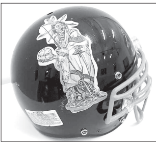
Items from Savages and Princesses .