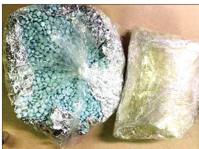
Pills and other drugs seized during arrests.