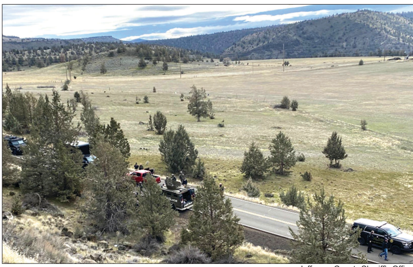
Scene of the stand-off on Pelton Dam Road.