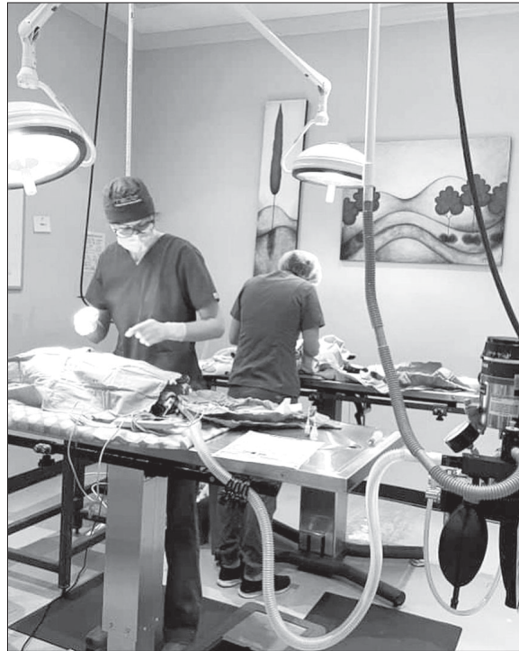
Fences for Fido reservation dog transport; and the spay-neuter operation.