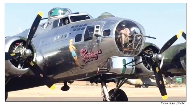
The Sentimental Journey B-17 will be at the Airshow.

The Airshow of the Cascades this year celebrates its Twentieth Anniversary at the Madras air field.