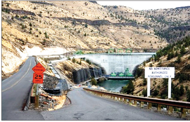
The Pelton-Round Butte project.

The agreement reached and approved by the federal government, after the membership voted to support the