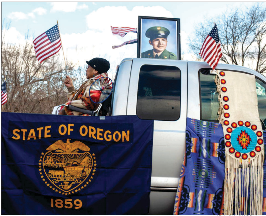
Above and at bottom: The 2020 Warm Springs Veterans Day Parade.

Thursday and Friday: Organization closure for Thanksgiving.