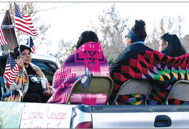
At the 2020 Warm Springs Veterans Day Parade.