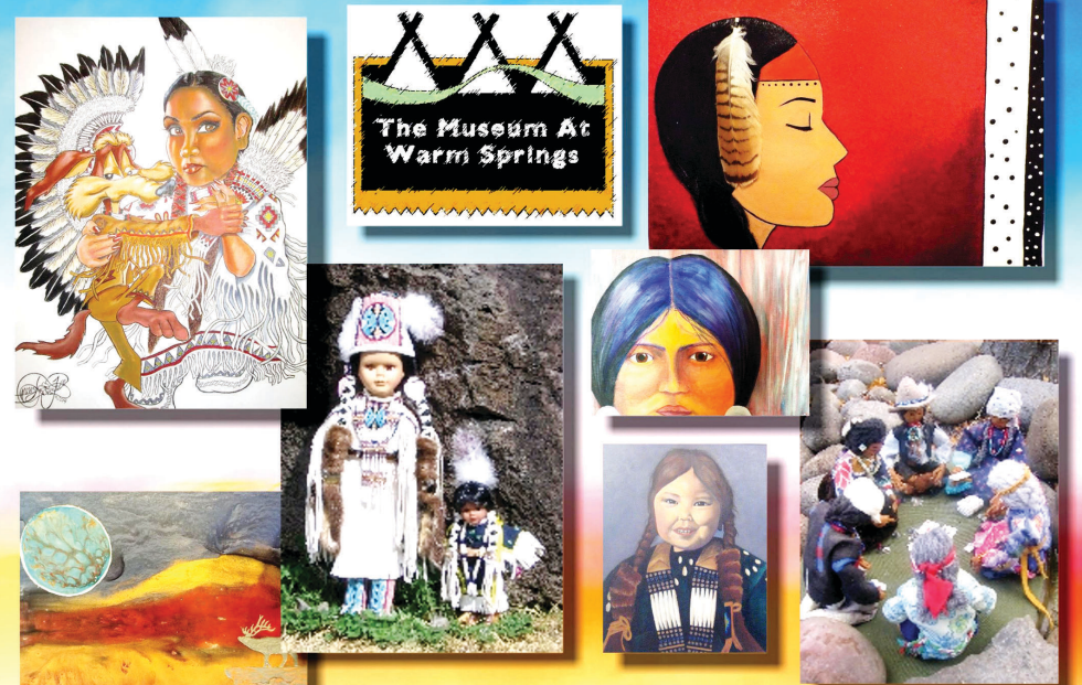
Exhibit Dates October 30, 2020 - January 9, 2021

The Deadline to submit Art is Friday OCTOBER 23, 2020 at 5 PM