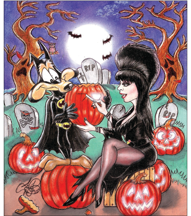
Halloween image by Warm Springs artist Travis Bobb.

Traditional Category: $500. Contemporary Category: $500. Video-Film-Short Film: $500. Honorable Mention Awards: Four awards at $250 per submission. When visiting the museum remember to wear a mask and social distance.