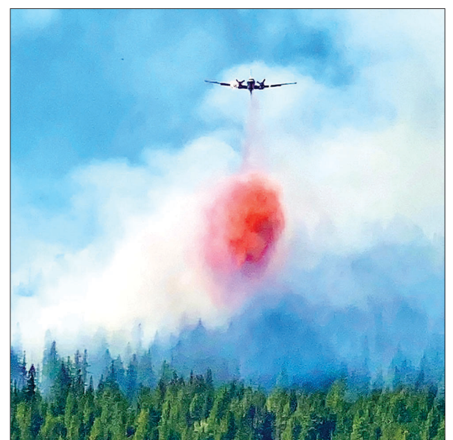
An air tanker drops retardant on reservation fire.

(Continued from page 1) Air support on Monday and Tuesday focused on the southern flank of the fire with dozer work taking place on the north side. The operation plan now is to improve the P-440 road in preparation for burning out the northern flank and prepping the eastern flank to secure the fire line. Crews were continuing road prep with masticators and hand work along the southern perimeter of the fire. A masticator is a machine used to grind, chip, or break apart fuels such as brush, small trees and slash into small pieces. There are 643 personnel assigned to these fires. Seventeen crews are working along with seven helicopters, 18 engines, four water tenders, nine dozers and 10 masticators.