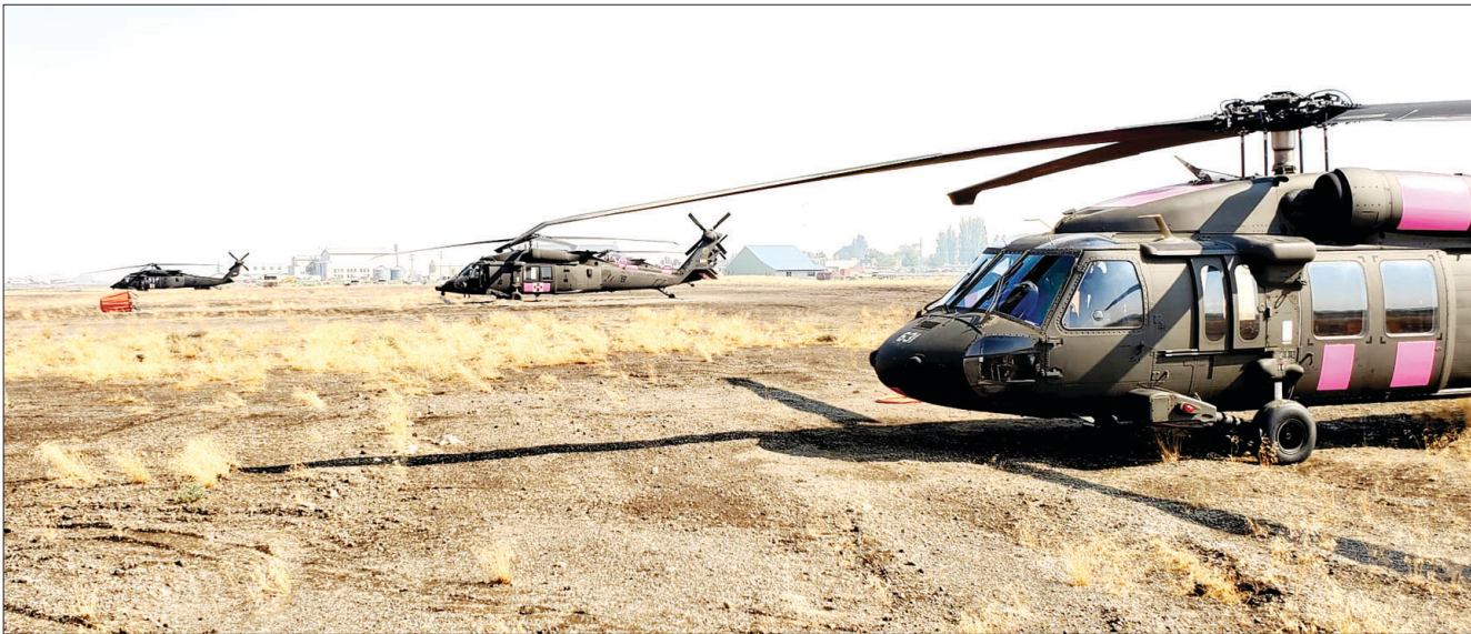
Helicopter support for the P-515, Lionshead and other fires burning in the region.