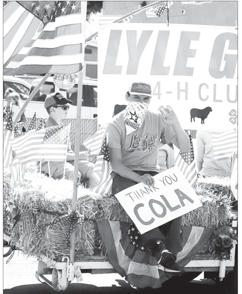
Edward Heath Photography

The artwork selected for the exhibition is as varied as the artists themselves. The exhibit features sculptures, paintings and photography expressing responses to the landscapes, history, cultures and wildlife of the High Desert in mediums ranging from oil to acrylic to mixed media.