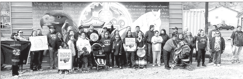
The Warm Springs Recovery Walkers.