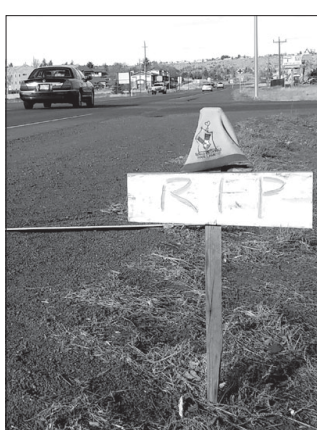
taken for that area.

Oregon Department of Transportation officials last week met with city officials, tribal representatives, and those running the shelter in order to consider safety precautions that may be