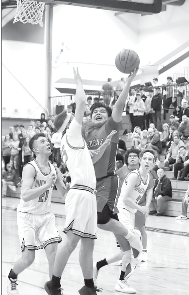
Madras in recent game vs. Molalla.

The varsity boys host North Marion this Friday, February 14, game time at 7 p.m. The boys are then away at Gladstone, February 18; home vs. Molalla, February 20; and then away at Estacada on February 24-25.