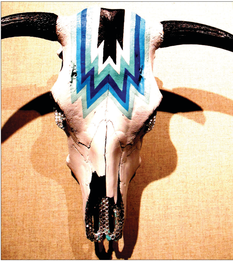
On this page are some of the items in the Member Art Exhibit. The winning pieces will be featured in the next Spilyay.