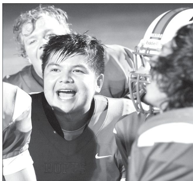
And celebrating the win...