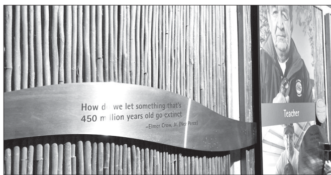
Detail from the lamprey Cultural exhibit at the zoo.