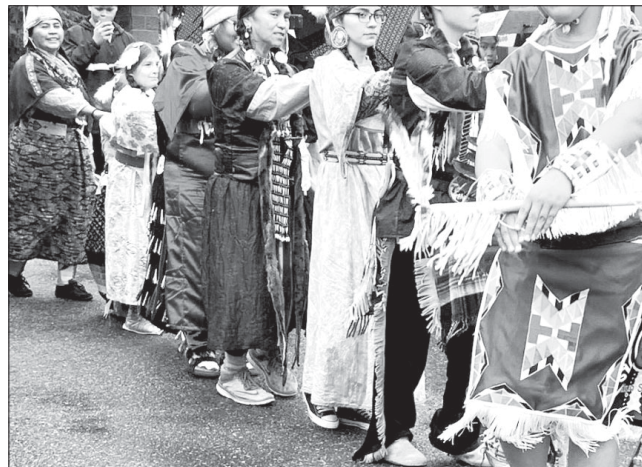
Tribal lamprey dance at the Oregon Zoo.

The permanent exhibit is part of the zoo's Northwest section. It features not only biological information about lamprey, but the deep cultural connection they have for the region's tribes.