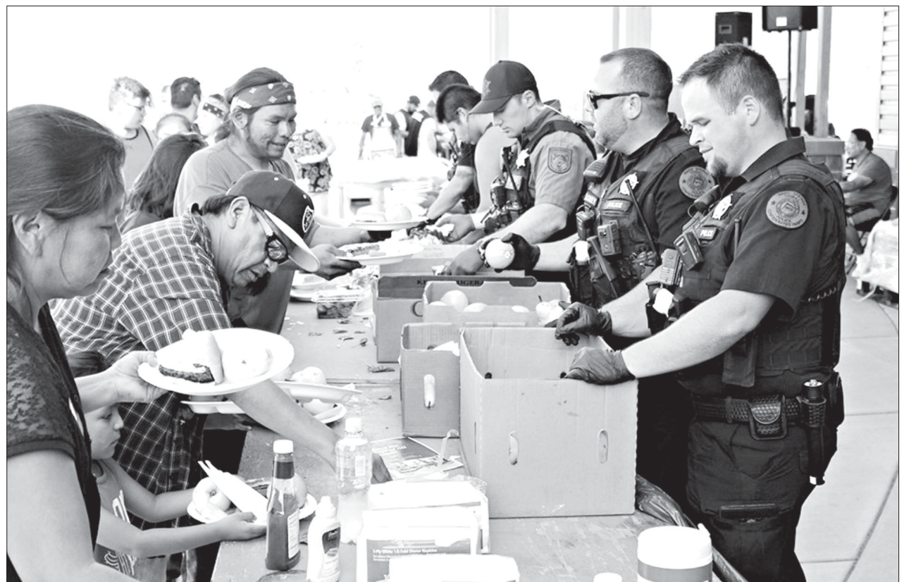
As the start of the 2019-2020 school year was approaching, the Warm Springs Academy, school district and community partners hosted the annual Back to School Barbecue, featuring the supplies giveaway and barbecue (above); while KWSO gave away many t-shirts. As in previous years, the event was well attended (right)

After eligibility is determined and you receive a letter, Consumer works with the Job Coach/Developer or Counselor to do a job search. Warm Springs Voc Rehab advocates for a job that matches Consumer's skills, interests and abilities.