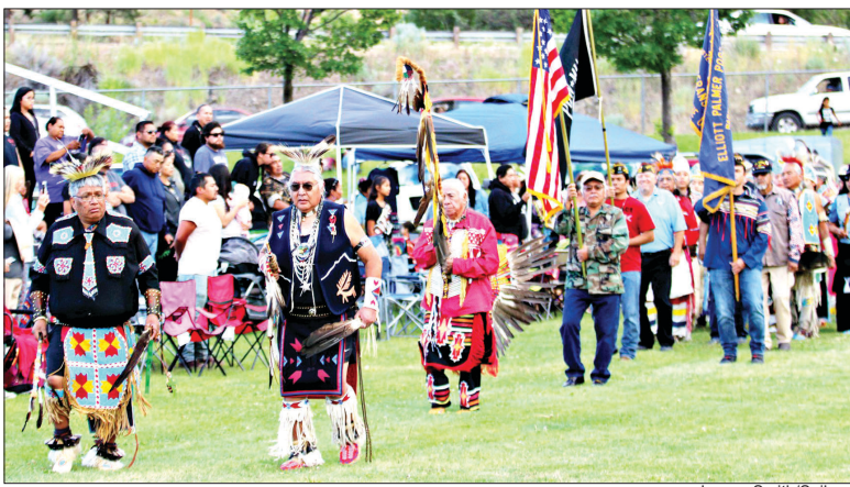
Pi-Ume-Sha 2019 Saturday Grand Entry