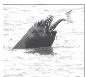
Columbia River sea lion with salmon.

The new guidelines that went into effect April 17 permit any California sea lion seen in the area on five occasions or seen eating a