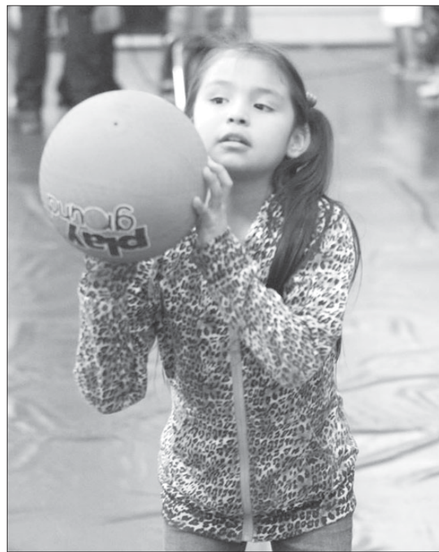
Over spring break Warm Springs Prevention and HAPPI hosted the Penny Carnival at the Youth Center gym, with games, music, food and crafts.