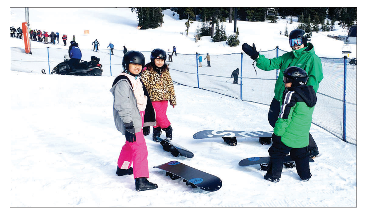
Plenty of snow made for a fun Tribal Ski Day at Mt. Hood Meadows.