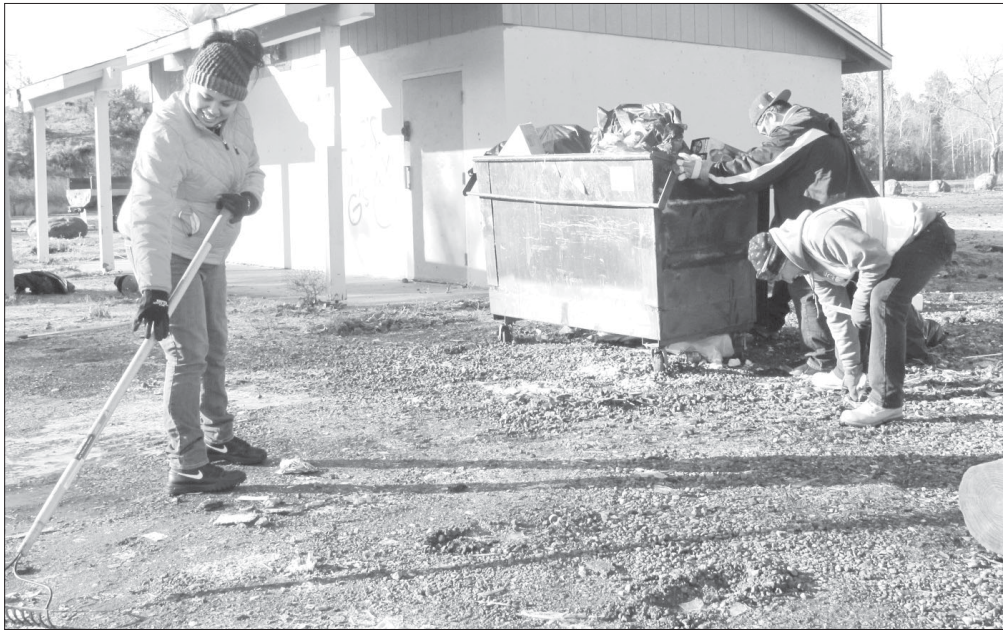
Cleanup volunteers arrive for sign-in (below left); and the cleanup around the park and creek (above, below right).

TRACES—Trauma Resilience and Adverse Childhood Experiences—provided the lunch for the volunteers. Warm Springs Community Health helped with the gloves, and the Prevention Team helped with a donation of trash bags and volunteer recruiting.