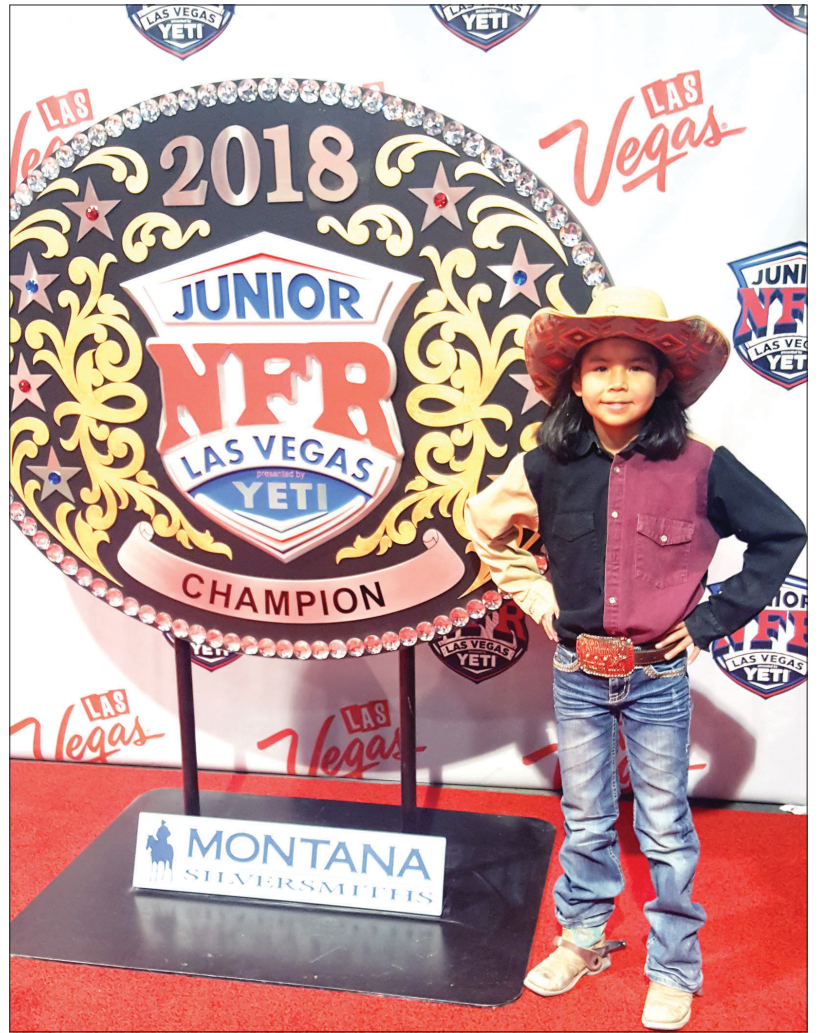
Siddalee ready to ride at the Junior Finals Rodeo.