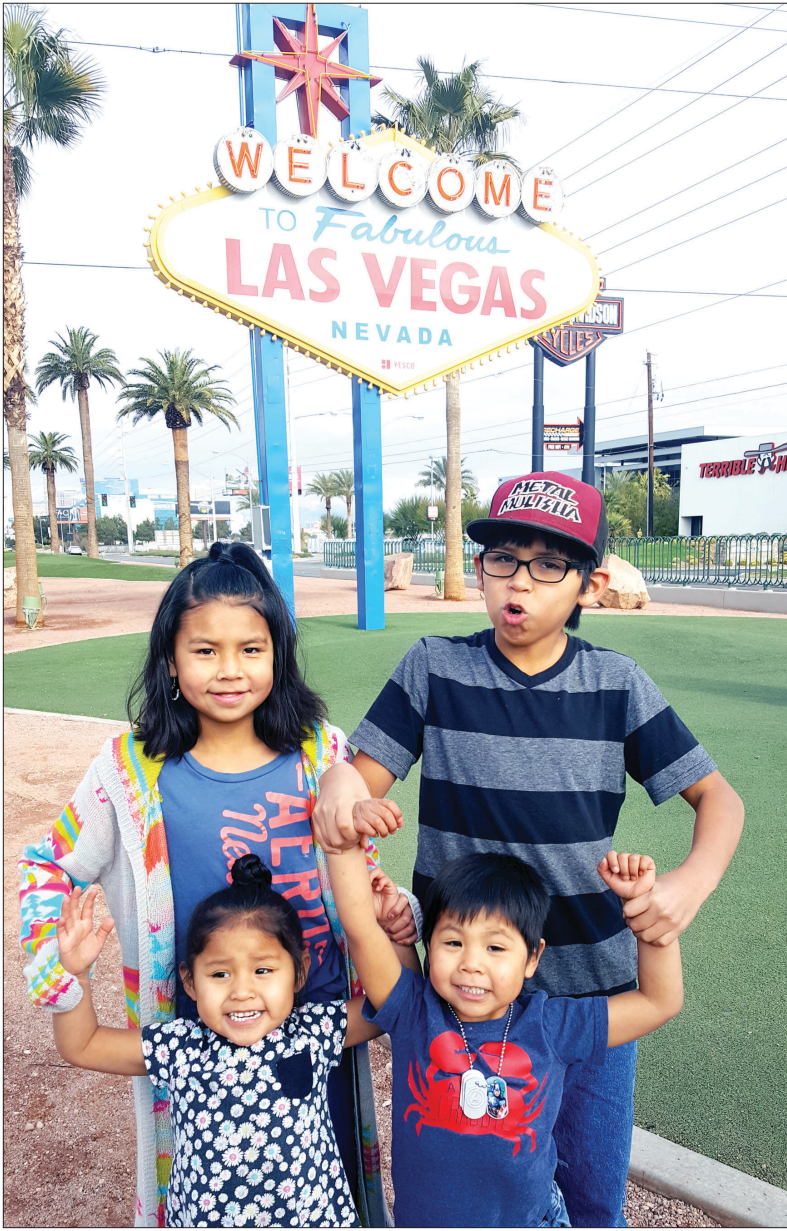
Brother and sisters arrive at Las Vegas for Finals.