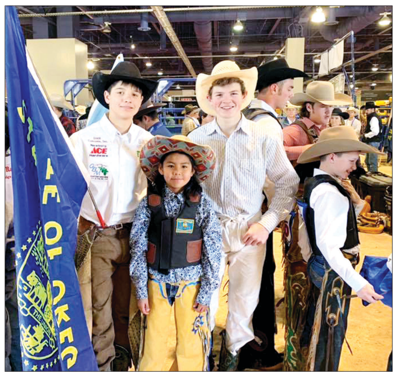
Team Oregon traveled together to rodeos through the year.