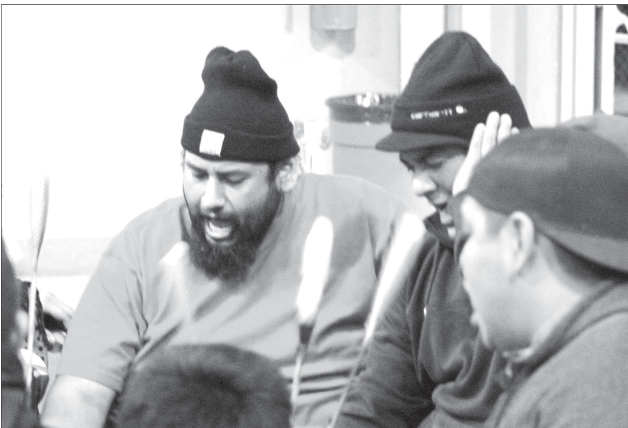
Drummers at Recreation’s December NDN Nite Out.