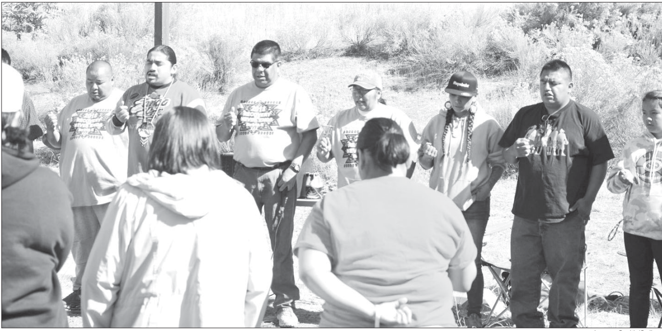
Warm Springs Behavioral Health and HAPPI (Health and Promotion Prevention Initiative)