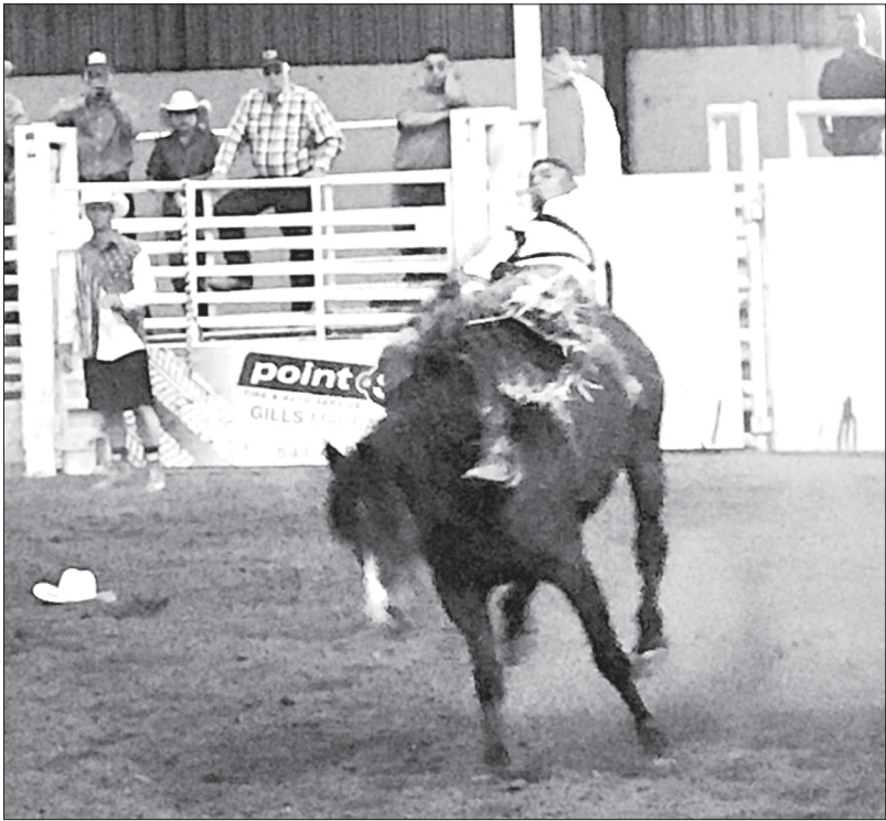
Bucking horses and riders at the Wester States Indian Rodeo Regional Finals.