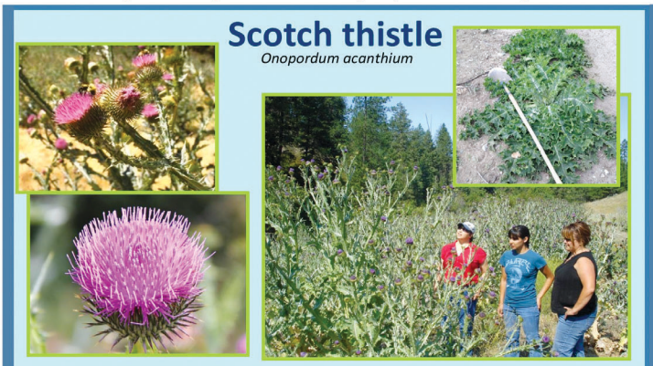
Scotch thistle Onopordum acanthium

These plants are non-native and crowd out native and desirable species important to our people and wildlife