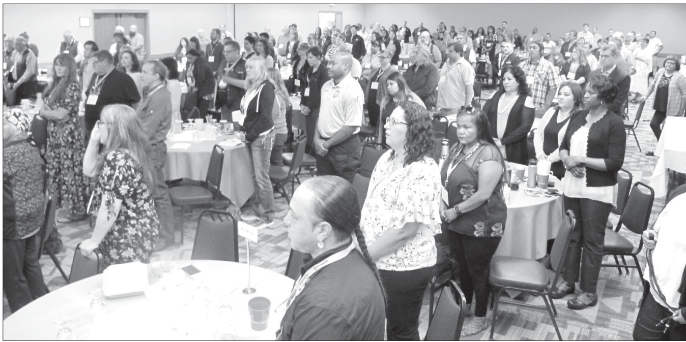
The many participants at the two-day conference at Kah-Nee-Ta, during traditional opening.

The Confederated Tribes and Health and Human Services this week hosted the first Oregon Tribal Summit on Opioids and Other Drugs.