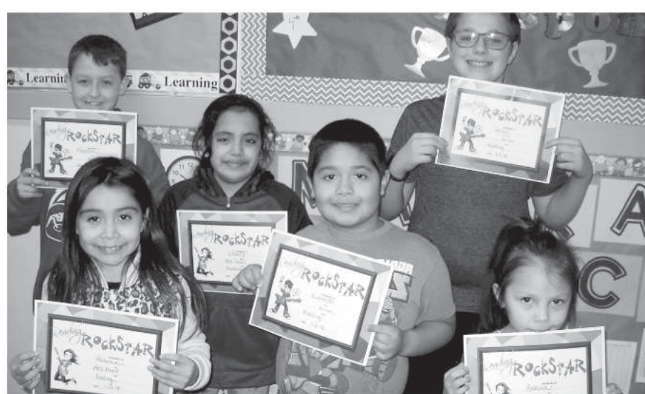
On January 12, Madras Elementary students from each grade level were recognized with STAR awards for their hard work in reading.