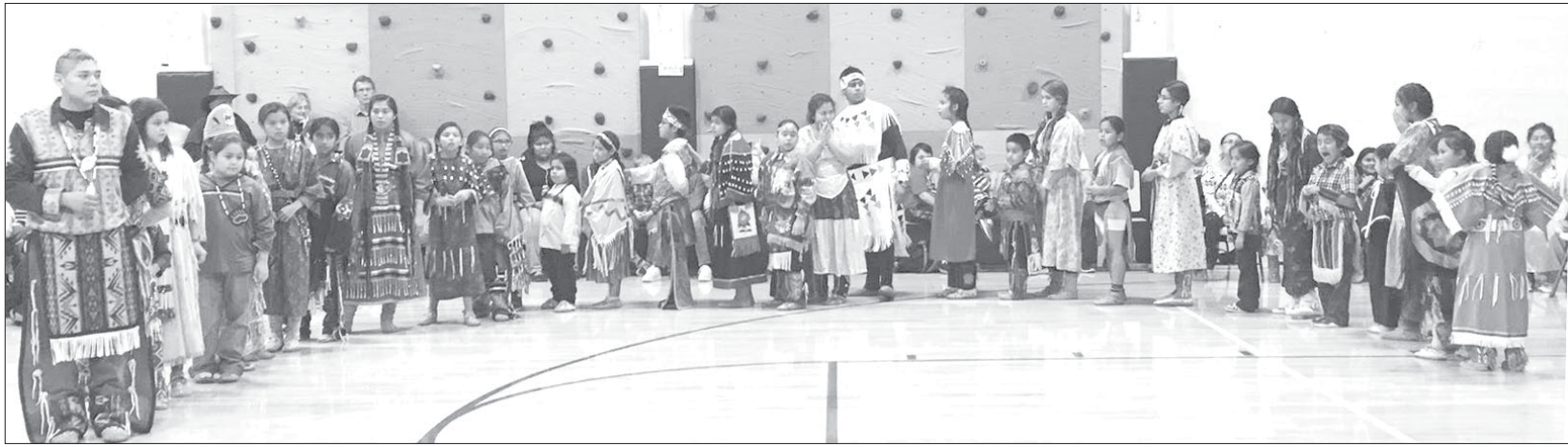
The Culture and Heritage Department and the Wasqu Dance Group shared a salmon and turkey meal and dance exchange, along with tribal members who attend the Wisbram School.

In the long-term, measuring high school and college graduation rates is key to assessing the program.