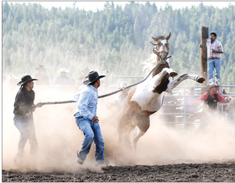
Team Chowder in Wild Horse Race.