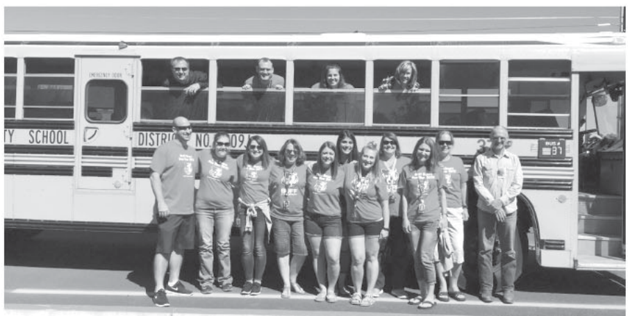
The Buff Elementary team gets ready to deliver popsicles in the community before the start of the school year.