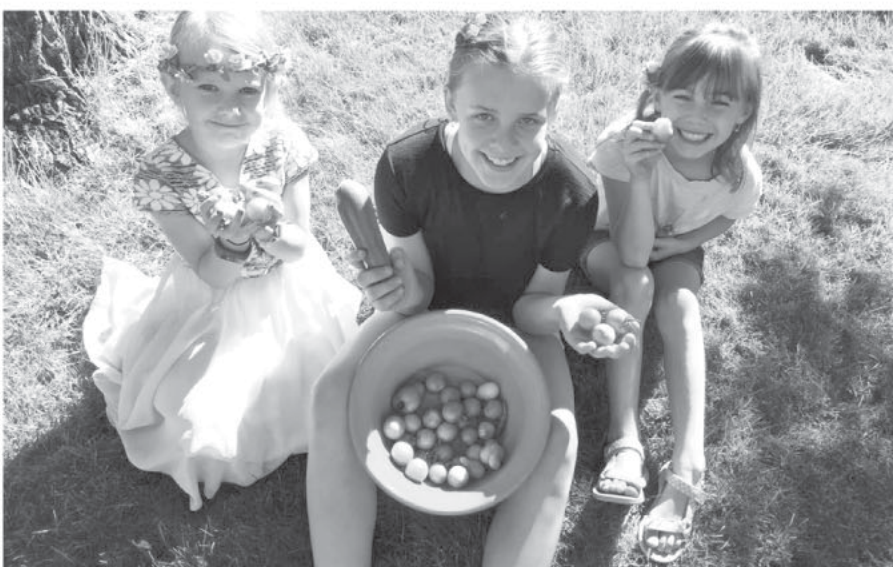
Metolius students share tomatoes picked from the school garden.

“We want to celebrate these remarkable leaders and their accomplishments while inspiring our current MHS students. These alumni who graduated from our local education system have made a tremendous impact both locally and worldwide. They are role models who exemplify the power of education and perseverance,” said Weddel.