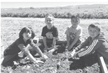
Students from Metolius Elementary grow gardening skills thanks to district and community support.

The garden and greenhouse at Metolius Elementary are in full bloom thanks to support from the JCS maintenance crew, district office, and local Lowes and Ace Hardware stores. Grants and donations have the kids up to their elbows in flowers and veggies and the monarch butterflies are thriving right alongside the students.