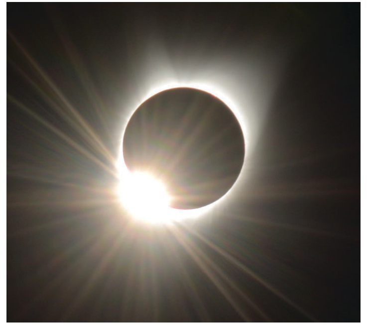
In Warm Springs last week, Ilijtsch van Beijnum, from The Hague, Netherlands, captured this eclipse photo, showing the solar Diamond Ring Effect. The effect is caused by beams of sunlight shining through a deep canyon on the moon.