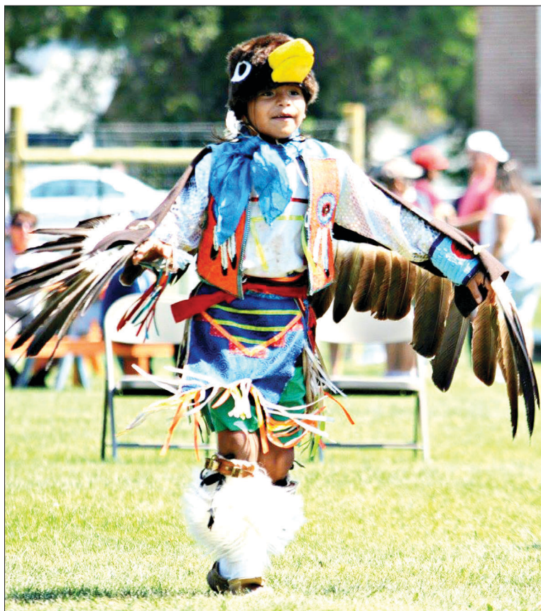
Native Sol powwow dancer; and an image of the totality.