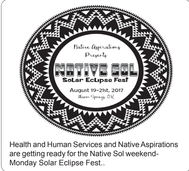
Health and Human Services and Native Aspirations are getting ready for the Native Sol weekend-Monday Solar Eclipse Fest.

Tribal youth are invited to join the Northwestern Earth