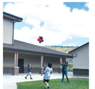
Students at WSK8 learn science and get ready for the solar eclipse by testing a mini-satellite payload.

ISTEM entwines tribal knowledge, culture, language and land with western science.