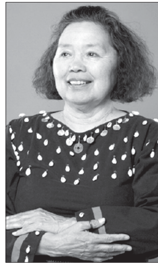
in itself is Native heritage.

Native ancestors lived on this land for thousands of years. The land contains the spirit of the ancestors, and