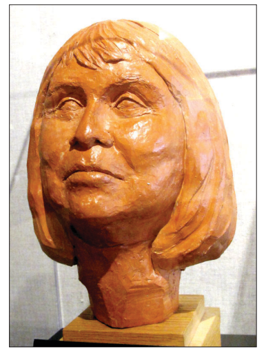
Faye Waheneka, terra cotta bust by Coralee Popp.