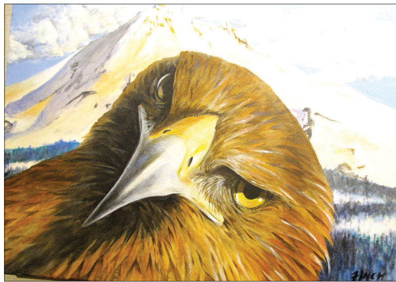
Eagle Selfie