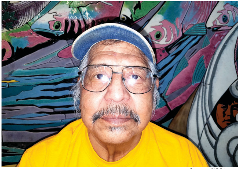
Kuks Animal