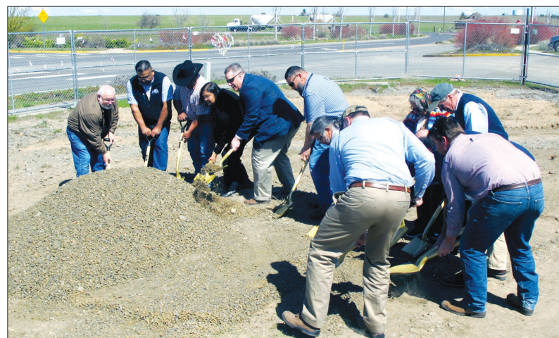
For the ceremonial ground-breaking at the Plateau Travel Plaza building site, tribal leaders were joined by city of Madras and construction company officials.

The Recreation Department hosted the 2017 Lil Miss Warm Springs Pageant in April, with several young contestants taking part in a colorful competition. After the awards ceremonies was the parade of contestants, featuring (photo at right):