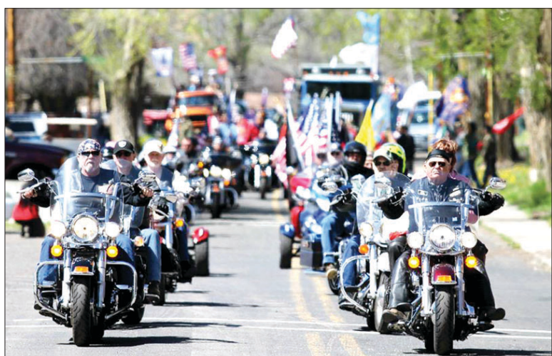
The Warm Springs Veterans of Foreign Wars, Ladies Auxiliary and American Legion on Saturday hosted the Welcome Home Vietnam Veterans Parade. The parade was from the war memorial area by the courthouse, to the Agency Longhouse. The American Legion Riders (above) joined the parade.