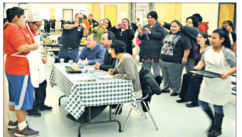
Warm Springs team at the judge's table.