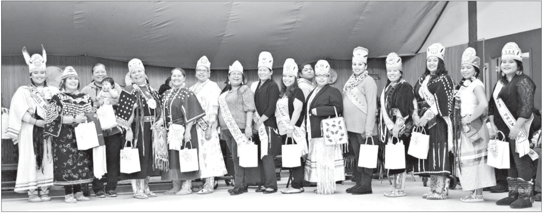
Many of the former Miss Warm Springs attended the pageant, held in December at the Agency Longhouse.