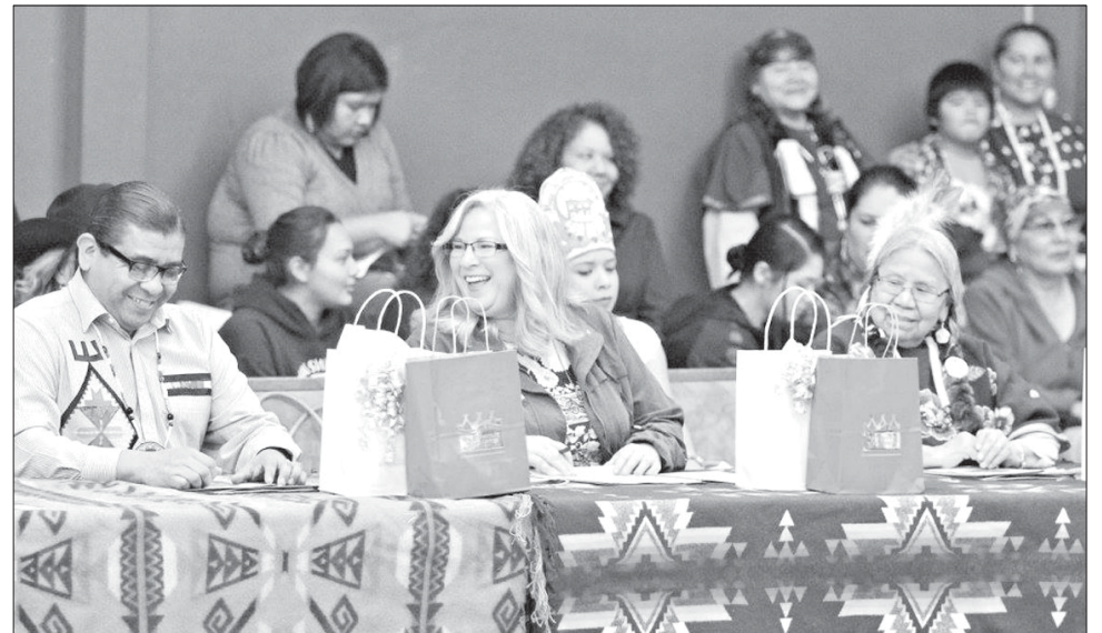
The judges panel at the Miss Warm Springs Pageant.

2. Development of a long term operations, capital improvement and management plan for KNT by December 31, 2017 that will ensure self-sufficient and financially sound opera-