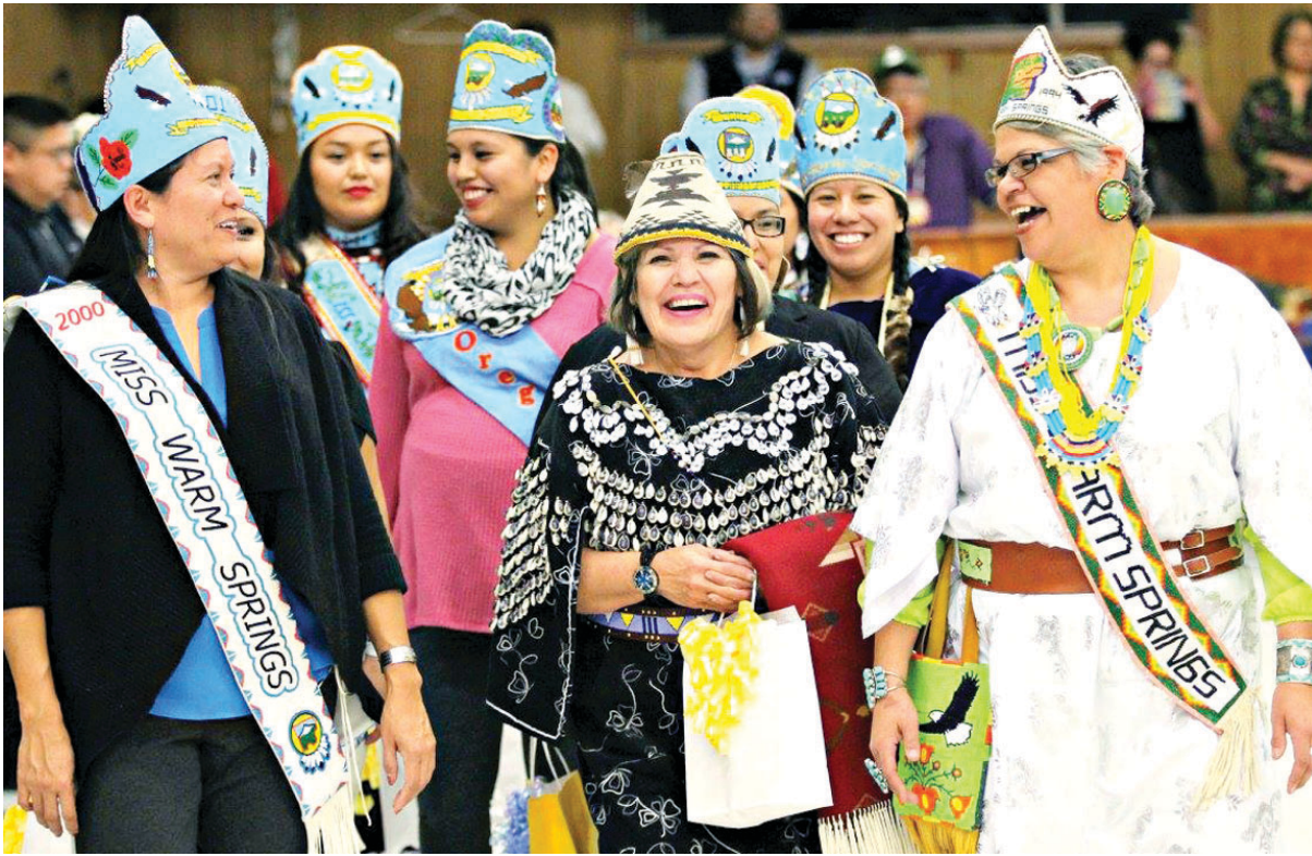
Some of the former Miss Warm Springs