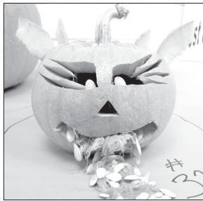
This pumpkin (above) was in the Scariest category at the Recreation Great Punkin Party.

Best Princess, Scariest Creature, Best Rebel and Jedi, Best Homemade, Best Empire and Sith. For more information call Recreation at 541-553-3243.