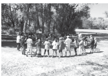
(Upper left): Teachers new to the district listened attentively to a panel of 509-J veterans during new teacher induction week. (Upper right): New 509-J teachers experienced a round dance with Warm Springs youth while touring the Museum at Warm Springs during new teacher induction week.