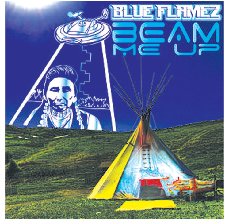
Cover of Beam Me Up

The Native American Music Awards are coming up in September 17, and Scott Kalama, performance name Blue Flamez, is a nominee.